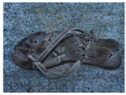
'Broken Foot-Unfolding Inequalities' – A Fundraiser Exhibit To Support Artists