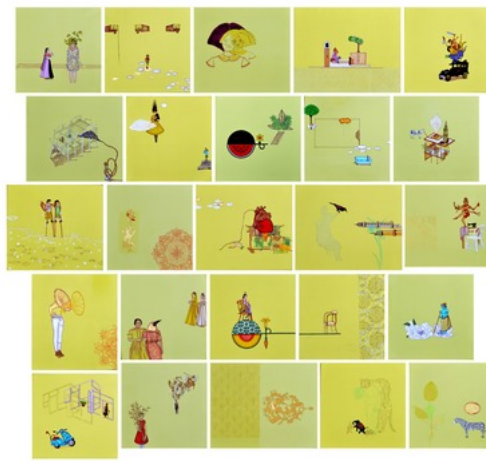
"Inheritance V" | Mainaz Bano | Gold leaf, varnish and acrylic on canvas | 43"x 41" (set of 25) | 2018