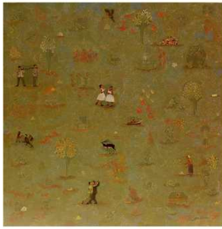
'Dancing Girls' | Sanket Virangami | Acrylic on canvas | 48"x 48" | 2020