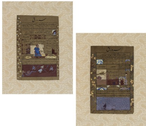
"Tales from Letters II" | Poushali Das | Tempera on wasli paper | 13"x 8.5" (each, set of 2) | 2015