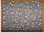
Taking Notes On Paintings From Rajasthan : Traditional And Modern