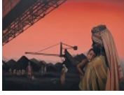
Artist United Collective's First Curatorial Project : 'Broken Foot-Unfolding Inequalities'