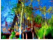
Reminiscing About The Outdoors: 5 Works Of Art For The Extrovert In You