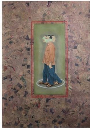
'Observation of a Pandemic Looker' | Ravi Chunchula | Gouache and news paper collage on rice paper | 28"x 19.5" | 2020

From afar, they look beautiful – a melange of rich colours, expertly layered in a composition both pleasing and evocative. But a closer examination unravels a whole other story – a story rendered through intricate details and graceful forms, painstakingly put together in a kaleidoscope where history comes alive. I am talking of course about the art of miniature painting – an art form that has been used as a tool to document lives for centuries. Miniature paintings might have originated way back around 750AD, but their revival within the contemporary framework is just as riveting as their traditional counterpart, if not more. A number of artists are taking the art form to new heights, exploring within the constraints of its delicate brushwork, a number of concerns speaking directly to the present times. And the best of them come together in New Stories in Old Frames – an exciting online exhibition of contemporary miniature paintings , put together by Dhi Artspace.